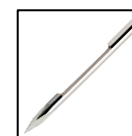
20mm sample notch